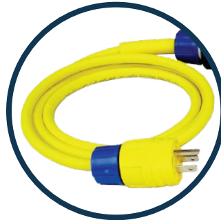
Watertight NEMA 5-15 Ericson Perma-Tite Plug .