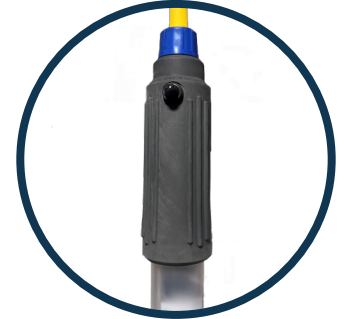
Handle with switch available on HL06 and HL11 . Add-HS.