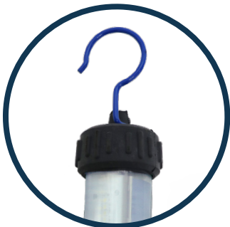
High abuse rubber cap with steel hook.